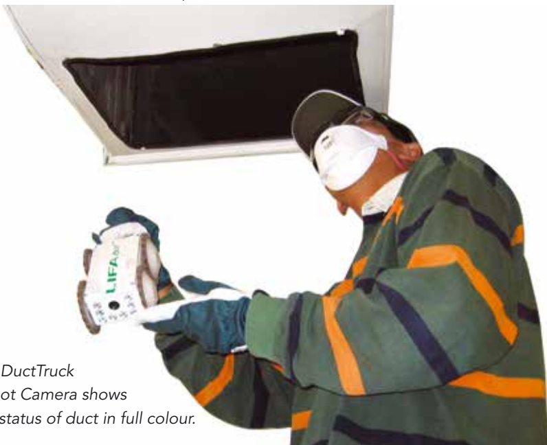
Lifa DuctTruck Robot Camera shows the status of duct in full colour.

Lifa Air is specialized in developing and producing methods and equipment for inspecting and cleaning of ventilation and air-conditioning systems. LIFA inspection cameras can be used both in rectangular and round ducts, as well in vertical as in horizontal ducts. The inspection visuals are immediately recordable. Camera equipment can also be used in guiding the cleaning devices during the cleaning process.