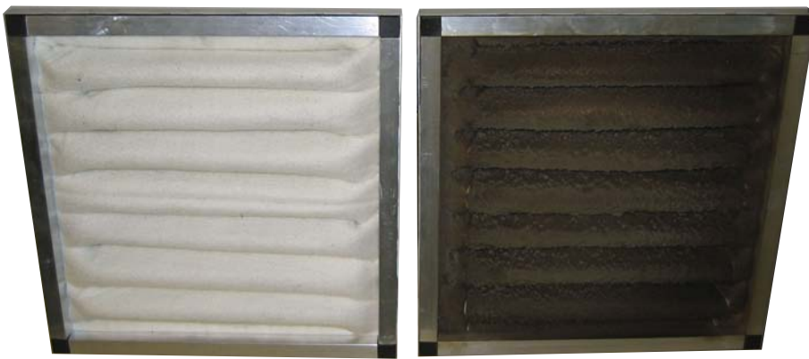
New Lifa 3G -tobacco smoke filter

The economical filter is suitable for all types of restaurants. The filter is available in two sizes depending on filtration requirements. The Smoke Eraser runs quietly and can easily be hidden away or painted to match any décor – the only evidence of its existence being purer indoor air.